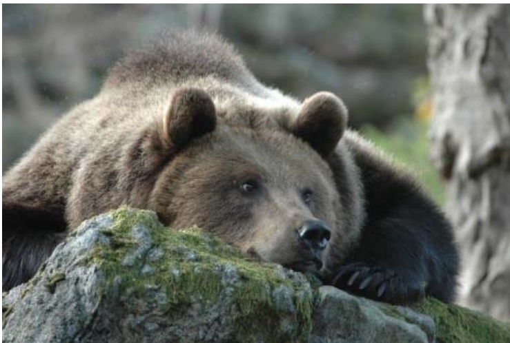
The brown bear has hibernation. In the warm seasons, he has diligently collected and consumed food in the winter of his supplies.

Energy-saving animals - a life on the edge 1 of 11