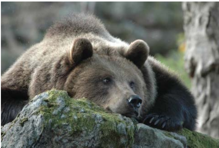
The brown bear has

Energy-saving animals - a life on the edge 1 of 11