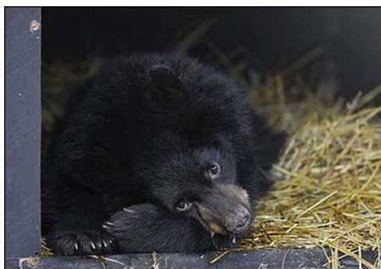
The American black bear stays warm when it hibernates. If sick humans could do that, they could heal better, scientists say.

However, even though they remained relatively warm, the bears' metabolism slowed significantly. (Metabolism is the set of functions a body needs to do to stay alive, including using oxygen and burning calories.) Hibernating bears used 75 percent less oxygen than in summer; their heart rate fell from 55 beats per minute to 14.