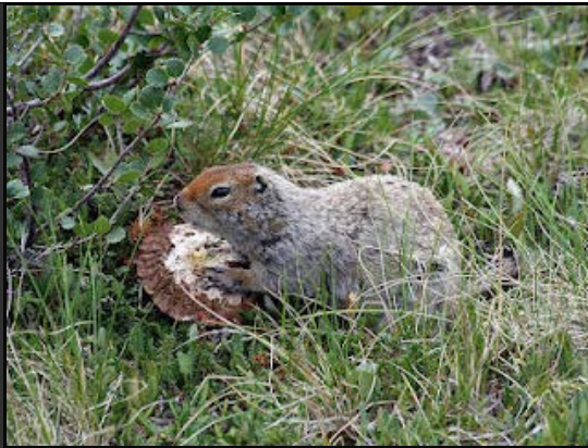
Maybe there's something in these yummy mushrooms that helps!