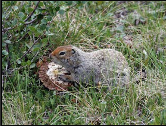
Maybe there's something in these yummy mushrooms that helps!