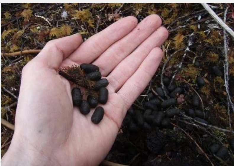
To researcher Todd Brinkman, the fecal pellet of a Sitka black-tailed deer is a "library" of information.